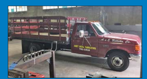
1989 Ford F-350 Dually Stake Bed Truck