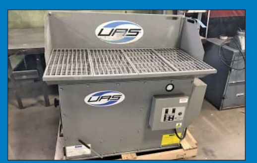
24" x 48" UAS Model VP-1500 Downdraft Grinding Bench (2008)