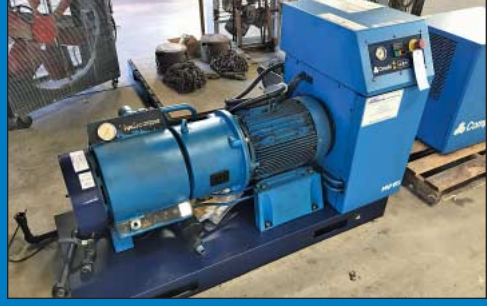
20 HP Compair Model HV-15 Air Compressor and Dryer