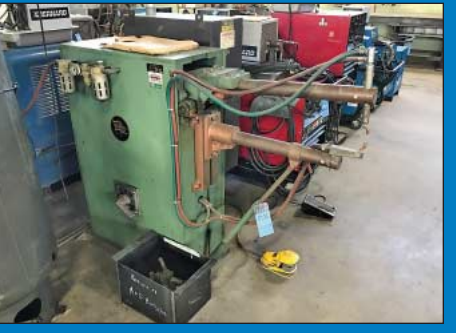
75 KVA Weltronic Model 2CR75A24 Spot Welder

48" X 36" Gamm Shot Blast Cabinet; S/N 5940821 Hossfeld No. 2 Pipe, Bar and Angle Iron Bender; with Spare Dies and Tooling