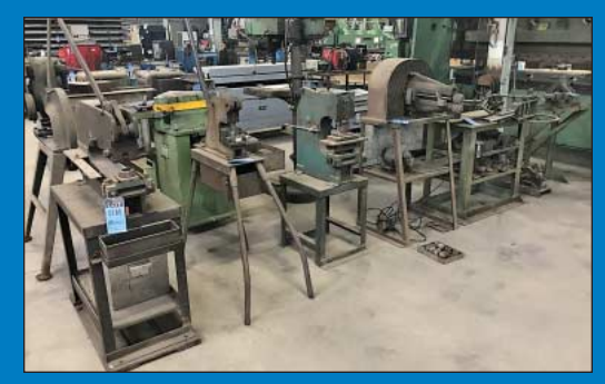
Manual Sheet Metal Equipment