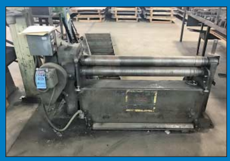
48" X 12 Ga. Reed Model 450 Plate Bending Machine