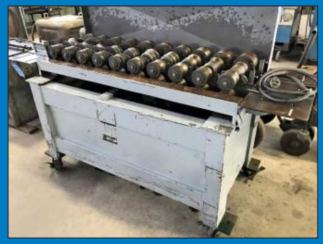
20 Ga. Lockformer 10-Stand Small and Large S and Drive Machine