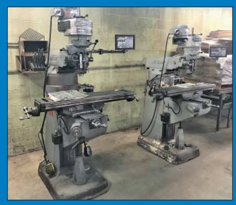
(2) 1-HP Bridgeport 8-Speed Vertical Mills