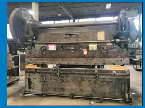
90 Ton X 10' Chicago Model 8L10 Mechanical Press Brake