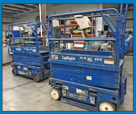
Upright MX-19 Self Traveling Electric Scissor Lift