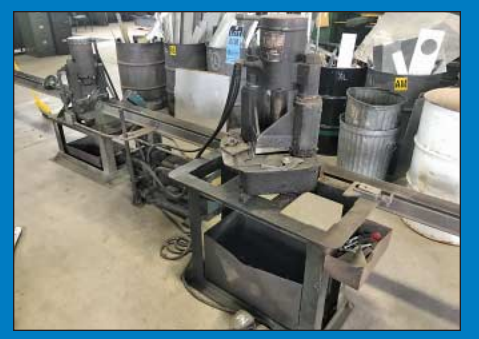
18 Ton X 6" WA Whitney Model 610089 Hydraulic Notcher