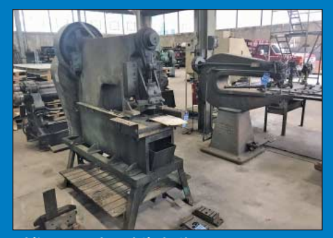
Whitney Punch and Circle Shear