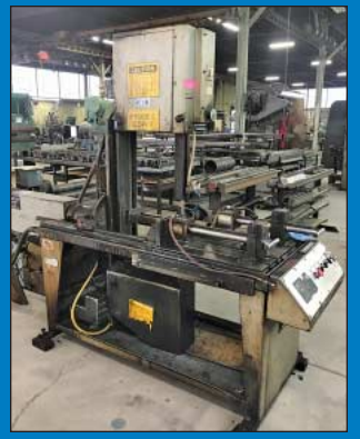
18" X 22" Hem Model V100LM Tilt Frame Vertical Band Saw