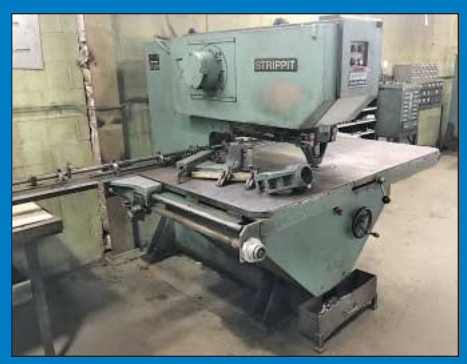
30 Ton Strippit Model Super 30/30