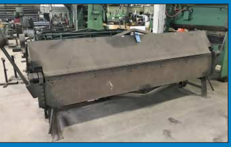
10' X 14 Ga. Chicago Model 1014 Manual Brake