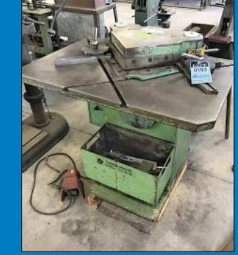
220 MM X 220 MM Boschert Model LB12PN4 Corner Notcher

Large Quantity of Shop and Support Equipment; Including Hand Tools, Power Tools, Box Fans, Work Benches, Steel Shelving, Dollies, Steel Containers, HD Industrial Carts, Shop Vacs, Vises, Air Hose, Clamps, Hand Punches, Bead Rollers, Crimpers, Arc Fit Manual Hand Press, Grindmy Wheels, Lifting Straps, 2-Door Cabinets, Saw Horses, Oxy Acetylene Carts, DE Grinders, File Cabinets, Hardware, Ladders, Pullies, Wire Slings, Chain Pulls, Steel Lifting Clamps, Platform Scales, Pallet Jacks, Dnils, Manual Tappers, Perishable Tooling and More