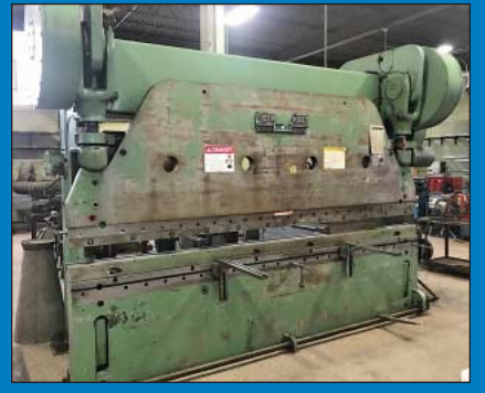
150/225 Ton X 12' Cincinnati Model 9 Series Mechanical Press Brake